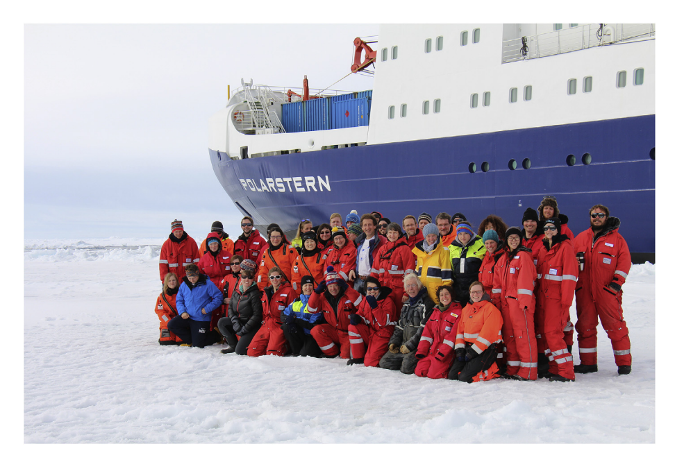
Fig. 3. Participants of the TRANSSIZ expedition in front of the German research icebreaker RV Polarstern.

resources in terms of money, time, and human resources in order to participate in such exchange and communication efforts play a crucial role, not least among Arctic indigenous peoples. Often ECS are only very rarely represented in meetings where recommendations to stakeholders and decision-makers are discussed.